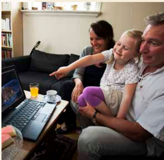
You can search and read 50,000 Norwegian books on bokhylla.no.

the National Library acquired the right to provide access to the digital editions of these newspapers in Norwegian libraries