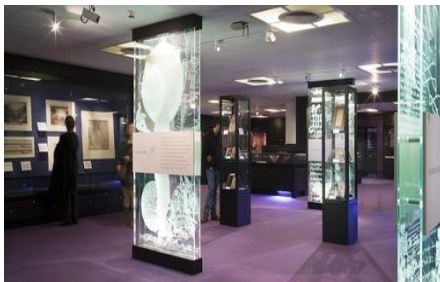
Treasures Gallery –

https://www.britishlibraryvenuehire.co.uk/venue-hire/