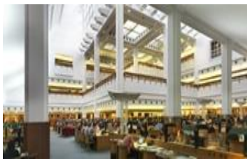
Reading Room -