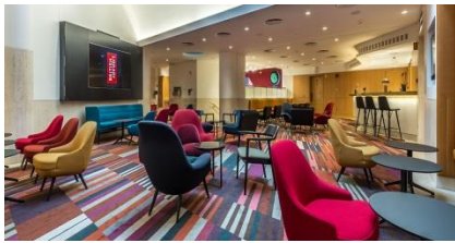
Knowledge Centre –

https://www.britishlibraryvenuehire.co.uk/venue-hire/