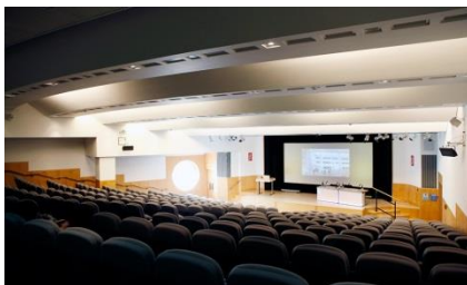
Knowledge Centre Auditorium -

https://www.britishlibraryvenuehire.co.uk/venue-hire/