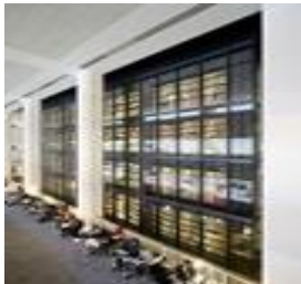
King's Collection -