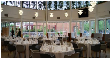
Terrace restaurant -

http://blogs.bl.uk/digitisedmanuscripts/2013/12/important-notice-temporary-closure-of-the-sir-john-ritblat-treasures-gallery.html