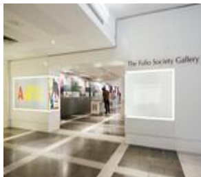
Entrance Hall Gallery (previously Folio Society Library) -