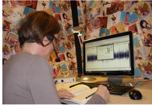
Audio Books Studio