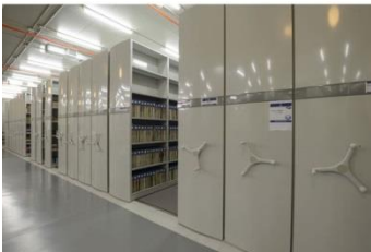
Storage rooms