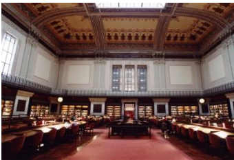
Main Reading room -

http://www.bne.es/es/AreaPrensa/MaterialGrafico/ImagenInstitucional/Sedes/index.html