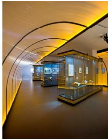
Exhibition Space -

http://www.bne.es/es/AreaPrensa/MaterialGrafico/ImagenInstitucional/Sedes/index.html