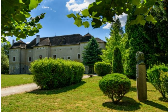
Slavic Museum of A. S. Pushkin