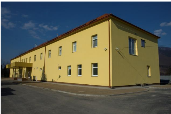
Digitisation and conservation centre

https://en.wikipedia.org/wiki/Slovak_National_Library