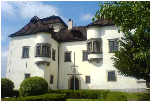
Castle in Diviaky (storage of old & rare prints collection)