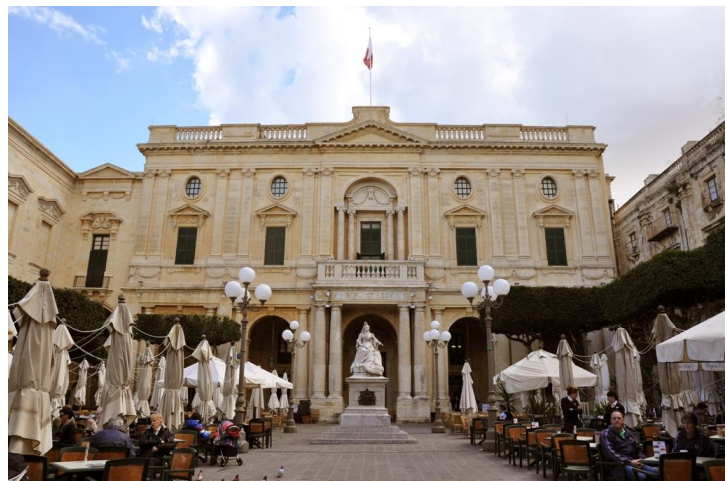
Exterior - The Façade of the National Library

The Reading Hall includes the exhibition area (in front), the research area (in the middle), and the area for public