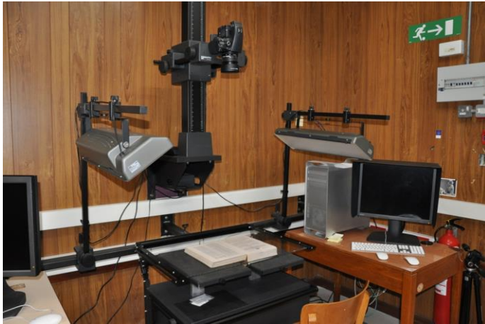
The Digitization Studio

events (at the rear). This photo was taken during an event after research hours.