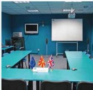
Study Centre -

http://nubsk.edu.mk/en/services/other/conference-and-study-center