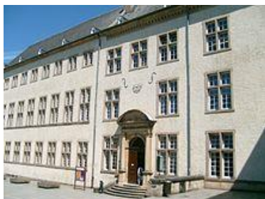
Exterior - https://en.wikipedia.org/wiki/National_Library_of_Luxembourg