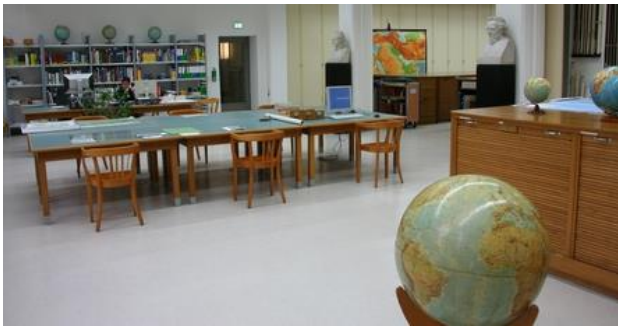
Reading room of the German Museum of Books and Writing