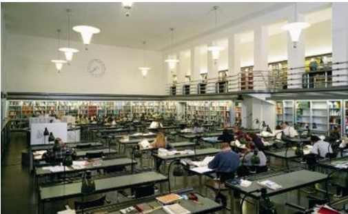
Reading room of the Anne-Frank-Shoah library