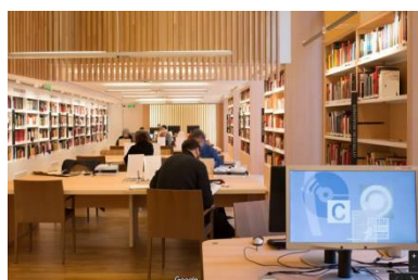
Reading room 2

http://www.bnf.fr/fr/la_bnf/bibliotheque_haut-de-jardin.html