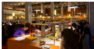
Reading room 1

https://www.google.co.uk/maps/place/The+Fran%C3%A7ois-Mitterrand+Library/