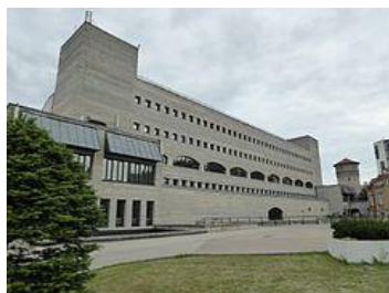
Exterior - https://en.wikipedia.org/wiki/National_Library_of_Estonia

Please provide brief details on the history of your library buildings.