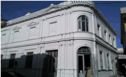
Cyprus Library Reference Department (Site 2) -

http://www.cypruslibrary.gov.cy/moec/cl/cl.nsf/DMLindex_en/DMLindex_en?opendocument