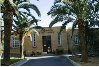
Cyprus Library (Site 1)-

http://www.cypruslibrary.gov.cy/moec/cl/cl.nsf/DMLindex_en/DMLindex_en?opendocument