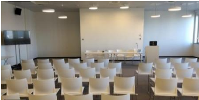
Royal Sky Room (Conference Hall)