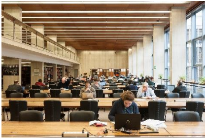
Main Reading Room