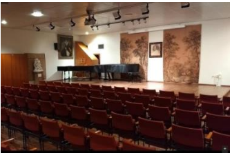
Auditorium (Concert Hall)