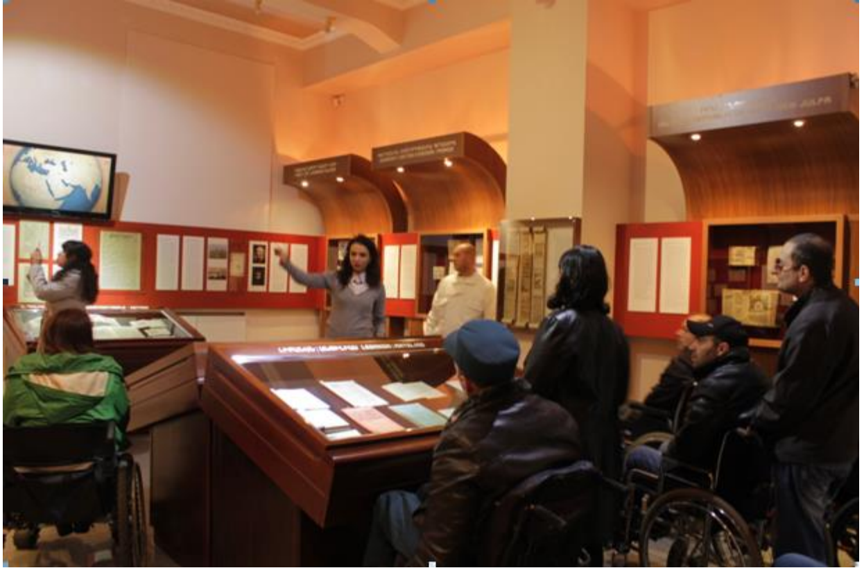
d/ Concert hall