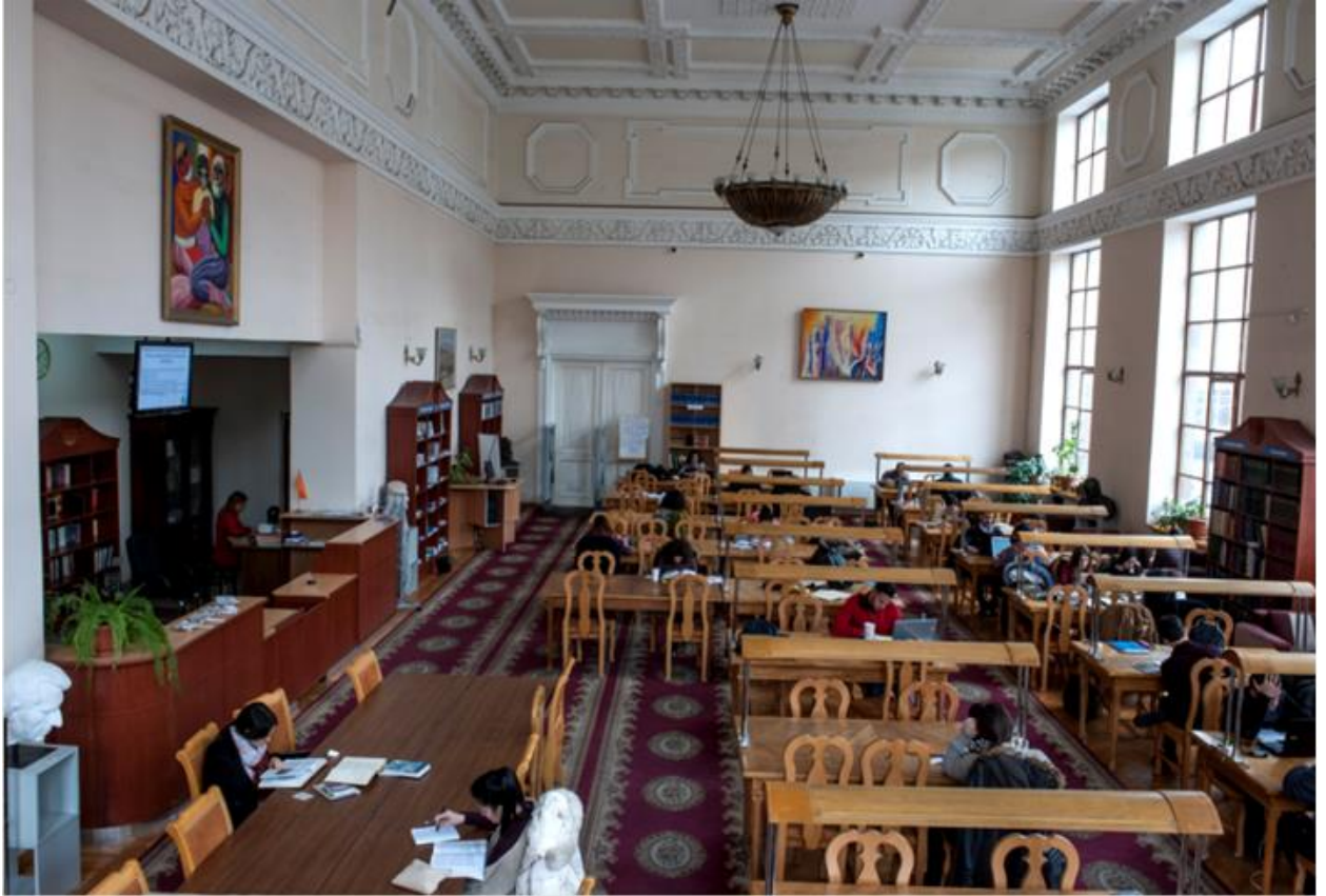
b) Conference Centre.