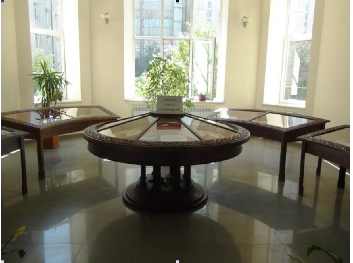
Book Printing Museum